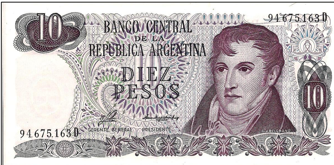
P300 10 Pesos front with General Manuel Belgrano