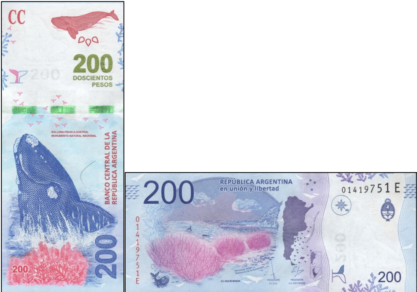
P364 200 Peso front with Southern right whale, coral ; reverse with Valdés Peninsula

Iguazu National Park (1984) with the falls as its main feature was added to UNESCO for its exceptional natural beauty and it's the habitat of rare and endangered species. The park spans Argentina and Brazil, with both parts being UNESCO sites. The waterfalls on both sides together span over 8858 feet and have a height of 262 feet. Iguazu is an indigenous (Tupi-Guarani) name, meaning Great Waters. Note Argentina was proclaiming the Iguazu falls 100 years before they were inscribed by UNESCO – but not at all since being inscribed!