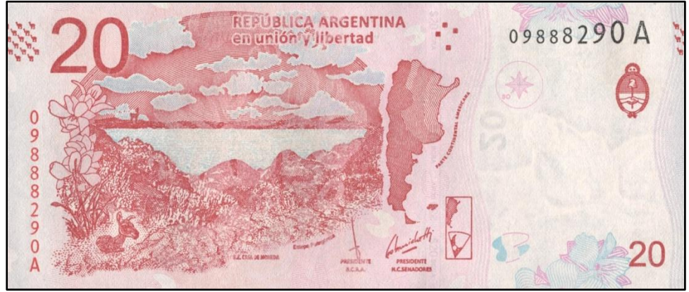
P361 20 Pesos – front with guanaco, reverse with lake and clouds over Patagonian steppe; map of Argentine Sea, Antarctica, and South Atlantic Islands