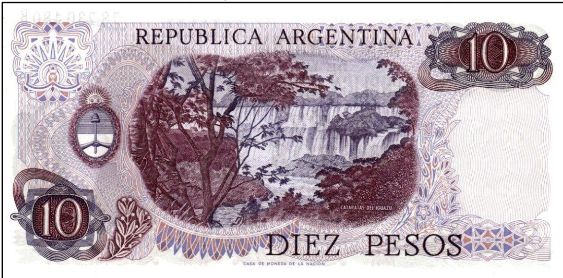
P300 10 Pesos reverse with Iguazu falls

The Jesuit Block and Estancias of Córdoba (2000) comprises complementing urban and rural settlements that were developed by the Society of Jesus as part of their missionary activities. In Córdoba proper, the Jesuits were allocated one of the blocks in the checkerboard plan of the city, where they built a university (Colégio Maximo), a college and a church that also held the Jesuit political/administrative bodies. The rural estancias, supported by complex hydraulic systems and worked by indigenous farmers and African slave laborers, were to provide the necessary resources through farming and textile production. Two identical Banco Provincial de Cordoba banknotes depict the cathedral at Cordoba with different printers.